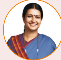
Smt. Dr. Prabha Mallikarjun Member of Parliament, Davangere, Governing Council Member, B.E.A. Council Member SSIMS & RC, Life trustee SS CARE TRUST